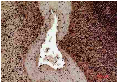
Immunohistochemistry (IHC) analysis of paraffin-embedded Human Spleen, antibody was diluted at 1:100.