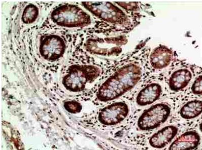
Immunohistochemistry (IHC) analysis of paraffin-embedded Human Colon, antibody was diluted at 1:100.