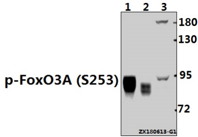
Western blot (WB) analysis of p-FoxO3A (S253) pAb at 1:500 dilution Lane1: The Testis tissue lysate of Rat(40ug) Lane2: The Testis tissue lysate of Mouse(20ug) Lane3: HeLa whole cell lysate(40ug)