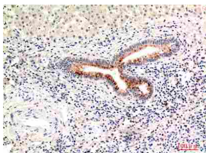
Immunohistochemistry (IHC) analysis of paraffin-embedded Human Liver, antibody was diluted at 1:100.