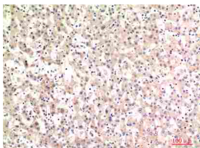
Immunohistochemistry (IHC) analysis of paraffin-embedded Human Liver, antibody was diluted at 1:100.