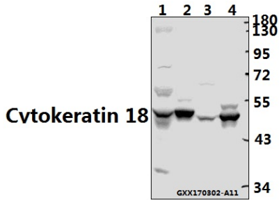
Western blot (WB) analysis of Cytokeratin 18 (T410) polyclonal antibody at 1:500 dilution Lane1:The Liver tissue lysate of Rat(40ug) Lane2:AML-12 whole cell lysate(20ug) Lane3:HEK293T whole cell lysate(40ug) Lane4:HCT116 whole cell lysate(20ug)