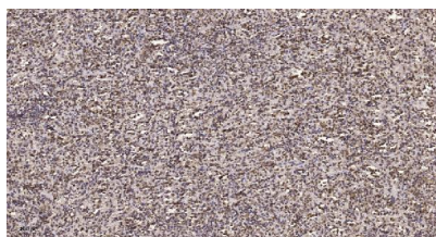
Immunohistochemical analysis of paraffin-embedded human spleen. 1, Tris-EDTA, pH9.0 was used for antigen retrieval. 2 Antibody was diluted at 1:200 (4° overnight). 3, Secondary antibody was diluted at 1:200 (room temperature, 45min).