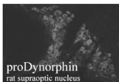
Figure 2. Immunofluorescent staining data of PDYN using Anti-proDynorphin PDYN Antibody (A02529).

Systemic artemin normalized immunohistochemical markers in the ipsilateral L5 DRG