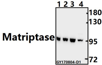
Western blot (WB) analysis of Matriptase (K21) pAb at 1:500 dilution Lane1:C6 whole cell lysate(40ug) Lane2:CT26 whole cell lysate(40ug) Lane3:HCT116 whole cell lysate(40ug) Lane4:PC3 whole cell lysate(40ug)