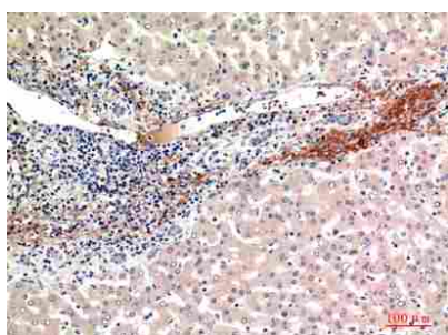
Immunohistochemistry (IHC) analysis of paraffin-embedded Human Liver, antibody was diluted at 1:100.