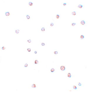
Immunocytochemistry of USP10 in Jurkat cells with USP10 antibody at 20 ug/mL.