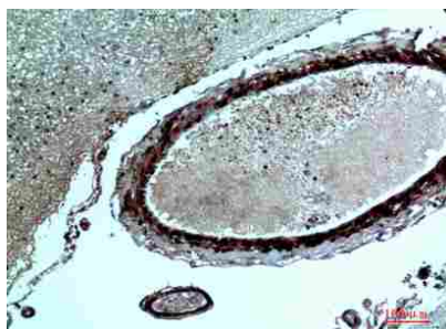
Immunohistochemistry (IHC) analysis of paraffin-embedded Human Brain, antibody was diluted at 1:100.