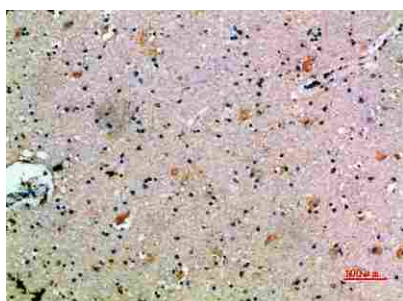
Immunohistochemical analysis of paraffin-embedded human-brain, antibody was diluted at 1:200.