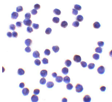
Immunocytochemistry of UBAP2L in HeLa cells with UBAP2L antibody at 10 ug/ml.