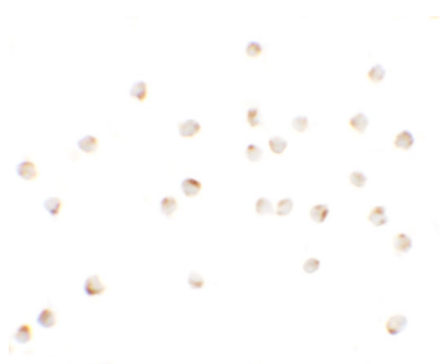
Immunocytochemistry of TSHZ1 in A20 cells with TSHZ1 antibody at 2.5 ug/mL.