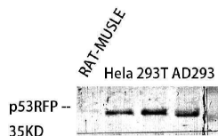
Western Blot analysis of various cells using p53RFP Polyclonal Antibody