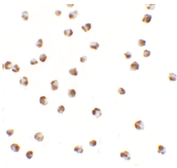
Immunocytochemistry of YPEL3 in A20 cells with YPEL3 antibody at 2.5 ug/mL.