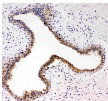
Anti-TrkC antibody, PA1992-1, IHC(P) IHC(P): Human Mammary Cancer Tissue