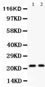
Anti-IL-18 antibody, PA2037, Western blotting All lanes: Anti IL-18 (PA2037) at 0.5ug/ml Lane 1: HELA Whole Cell Lysate at 40ug Lane 2: Human Placenta Tissue Lysate at 50ug Predicted bind size: 22KD Observed bind size: 22KD