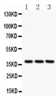
Anti-Bonzo antibody, PA2082, Western blotting All lanes: Anti Bonzo (PA2082) at 0.5ug/ml Lane 1: HELA Whole Cell Lysate at 40ug Lane 2: JURKAT Whole Cell Lysate at 40ug Lane 3: MCF-7 Whole Cell Lysate at 40ug Predicted bind size: 39KD Observed bind size: 39KD