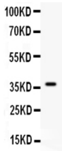
Figure 1. Western blot analysis of C5A using anti-C5A antibody (PB9187). Electrophoresis was performed on a 5-20% SDS-PAGE gel at 70V (Stacking gel) / 90V (Resolving gel) for 2-3 hours. Lane 1: recombinant rat C5A protein 0.5 ng. After electrophoresis, proteins were transferred to a nitrocellulose membrane at 150 mA for 50-90 minutes. Blocked the membrane with 5% non-fat milk/TBS for 1.5 hour at RT. The membrane was incubated with rabbit anti-C5A antigen affinity purified polyclonal antibody (Catalog # PB9187) at 0.5 ug/mL overnight at 4°C, then washed with TBS-0.1%Tween 3 times with 5 minutes each and probed with a goat anti-rabbit IgG-HRP secondary antibody at a dilution of 1:5000 for 1.5 hour at RT. The signal is developed using an Enhanced Chemiluminescent detection (ECL) kit (Catalog # EK1002) with Tanon 5200 system. A specific band was detected for C5A at approximately 37 kDa. The expected band size for C5A is at 37 kDa.