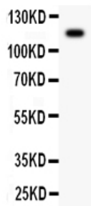
Figure 2. Western blot analysis of C5A using anti-C5A antibody (PB9187). Electrophoresis was performed on a 5-20% SDS-PAGE gel at 70V (Stacking gel) / 90V (Resolving gel) for 2-3 hours. The sample well of each lane was loaded with 30 ug of sample under reducing conditions. Lane 1: rat liver tissue lysates. After electrophoresis, proteins were transferred to a nitrocellulose membrane at 150 mA for 50-90 minutes. Blocked the membrane with 5% non-fat milk/TBS for 1.5 hour at RT. The membrane was incubated with rabbit anti-C5A antigen affinity purified polyclonal antibody (Catalog # PB9187) at 0.5 ug/mL overnight at 4°C, then washed with TBS-0.1%Tween 3 times with 5 minutes each and probed with a goat anti-rabbit IgG-HRP secondary antibody at a dilution of 1:5000 for 1.5 hour at RT. The signal is developed using an Enhanced Chemiluminescent detection (ECL) kit (Catalog # EK1002) with Tanon 5200 system. A specific band was detected for C5A at approximately 115 kDa. The expected band size for C5A is at 115 kDa.