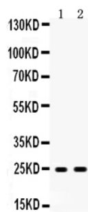
Figure 1. Western blot analysis of APOA1 using anti-APOA1 antibody (PB9845).

Electrophoresis was performed on a 5-20% SDS-PAGE gel at 70V (Stacking gel) / 90V (Resolving gel) for 2-3 hours. The sample well of each lane was loaded with 30 ug of sample under reducing conditions.