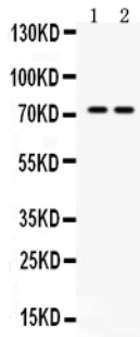
Figure 1. Western blot analysis of MDMX using anti-MDMX antibody (PB9872).

Electrophoresis was performed on a 5-20% SDS-PAGE gel at 70V (Stacking gel) / 90V (Resolving gel) for 2-3 hours. The sample well of each lane was loaded with 30 ug of sample under reducing conditions.